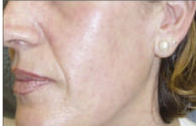
*example of treatment on Rosacea with a course of Azelac peels